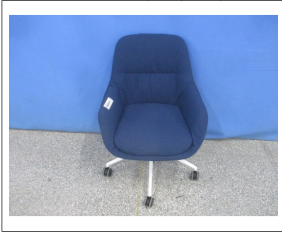
Received sample 2 (view 1)