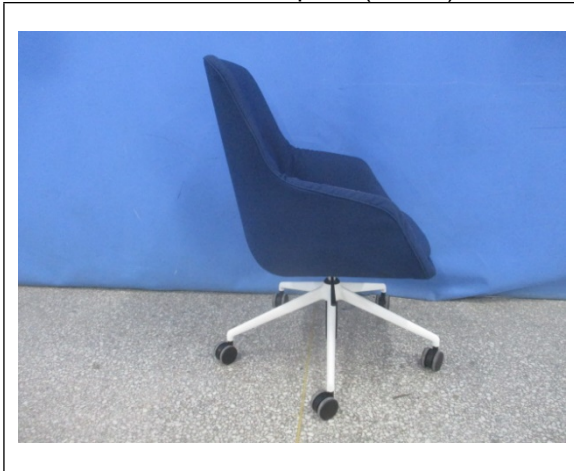
Received sample 2 (view 3)