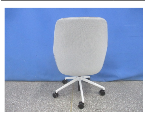
Received sample 1 (view 3)