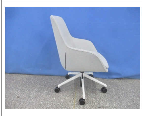
Received sample 1 (view 2)