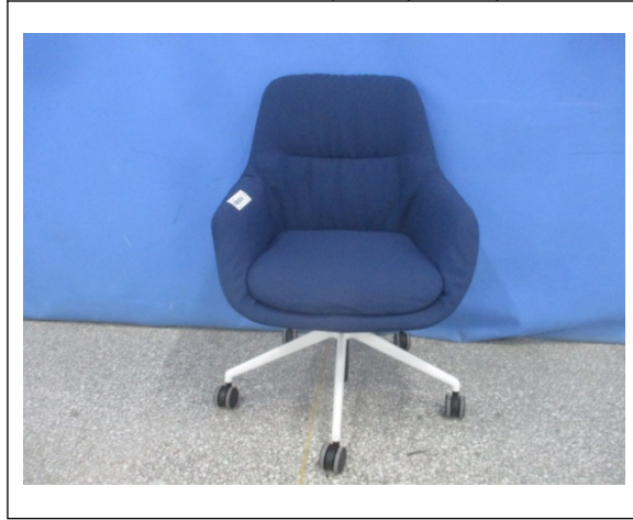
Received sample 2 (view 2)