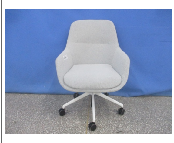
Received sample 1 (view 1)